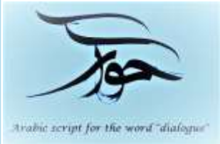
Arabic script for the word "dialogue"

Tuesday, April 23 from 6:15-8:30 PM In the Franciscan Center for Urban Ministry