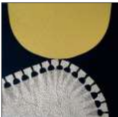
On the Backs of the Poor