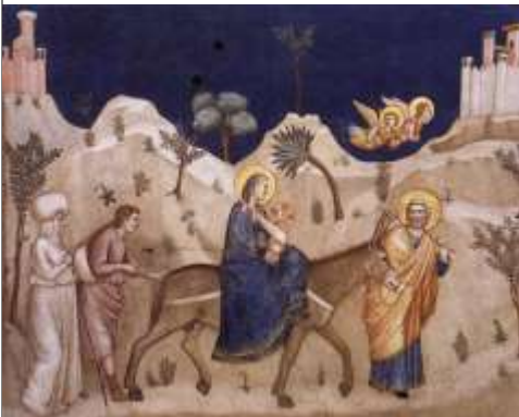
Flight into Egypt, c.1311 - c.1320 - Giotto

Also visit these websites: Sharejourney.org , and/or ArchdioceseofHarford.org .