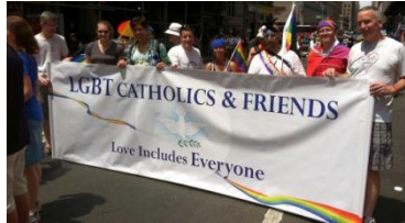
Catholic Inter-Parish Collaborative Marches in 2013 NYC Pride Parade

Open Hearts GLBT Ministry is a member of this tri-state area (CT, NY, NJ) Collaborative .The Collaborative has the following mission statement: “We are a Roman Catholic parish collaborative grounded in the Gospel message of love and welcome for all God’s children. We encourage dialogue to promote effective models of LGBT ministry.” Representatives from Open Hearts attend these quarterly meetings and participate in events sponsored by the Collaborative. See www.lgbt-ipc.org for more information.