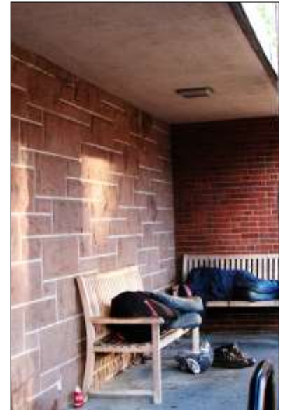
Some homeless find respite on wooden benches.